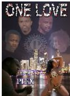
"Plex latest novels," "One Love" And Street Raised 2